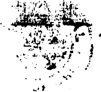
VICINITY MAP - NO SCALE -